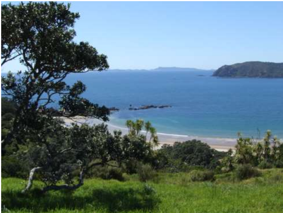
A typical Coromandel vista: Overlooking the white sands of Waikawau Bay

There are many opportunities for outdoor activities in the Moehau area: beach and bush walking, horse trekking, fishing, shell fish gathering, swimming, kayaking, bird watching, star-gazing and kiwi listening at night.