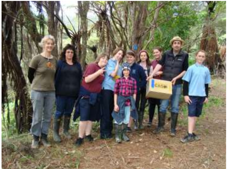
School children from Coromandel help carry in stoat traps

Our volunteers come from a wide range of backgrounds, and you don't need any prior skills or experience. We have tasks appropriate for a range of fitness levels. However, due to the physical nature of many tasks, a good level of fitness is desirable. You must be aged over 18 if you are an international visitor to New Zealand.