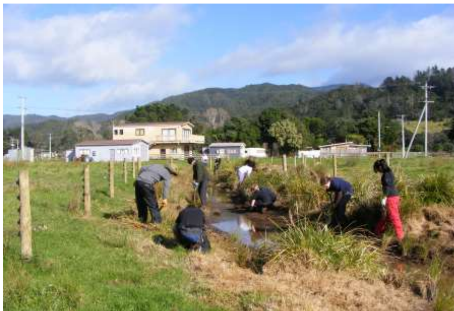
Global Volunteers help plant natives along a stream bank.

If you have any queries you would like to discuss about the information provided here please email info@meg.org.nz