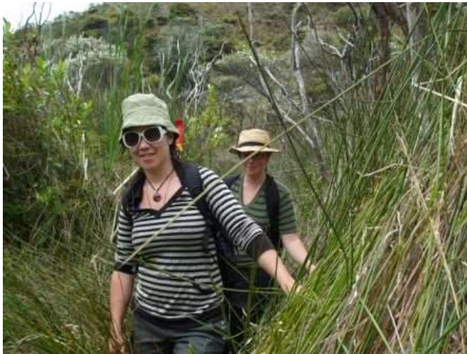
Volunteers off to track cut rodent trap lines at back of wetland

You will be expected to work 5 days per week. The daily schedule will vary; however, you can expect to be working between the hours of 8.30am and 5pm. You need to be ready for the day's activities by the given time with the appropriate gear. You will be