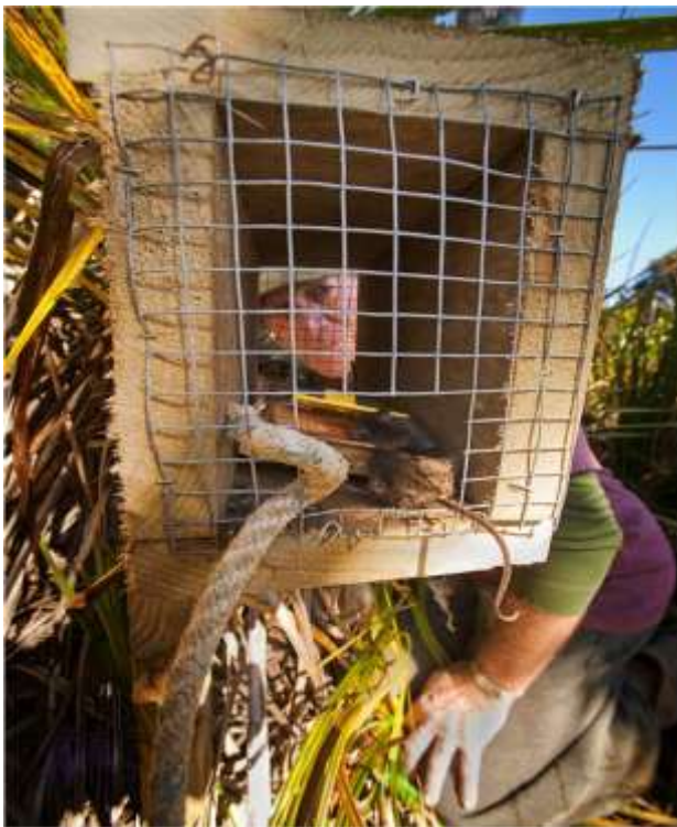
Waikawau Wetland project leader Wayne Todd inspects a rat trap

All Project leaders are experienced in back country navigation and safety. Program activities will have volunteers working with one or all of the leaders in any given week depending on weather, individuals abilities, fitness levels and of course what needs to be done.