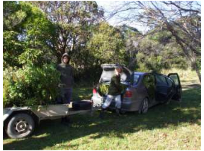
Photo on the right: Kathi and Rewi about to unload 776 trees from car and trailer! There were 24 which wouldn't fit in!

Thanks to the Environment Waikato Honda Tree Fund, Moehau Environment Group will once again this year be doing restoration work at the Waikawau Bay estuary and wetlands. There will also be more trees for the Children's Forest planting and a wetland valley restoration started last spring. This will bring the total areas of plantings to approximately 5ha. Plants include Kahikateas, Carex, Cabbage trees, Flax, Five Fingers, Kowhai and Karo. Some will eventually provide habitat for the Pateke (brown teal), while others will provide nectar, fruit and seeds for all sorts of native creatures big and small.