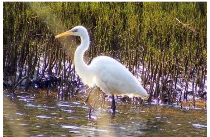
Kotuku now back in residence at Waikawau estuary