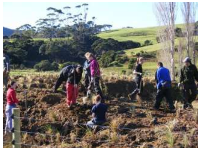
World Environment Day June '08 planting action

A big thank you to the TDCD and DOC for providing plants and also to Banrock Station Wines for funding earth works at the new Gordon Caldwell Reserve wetland at Port Charles. With their support our latest group from the Global Volunteer Network enjoyed a sparkling winters day planting at the reserve to mark World Environment Day.