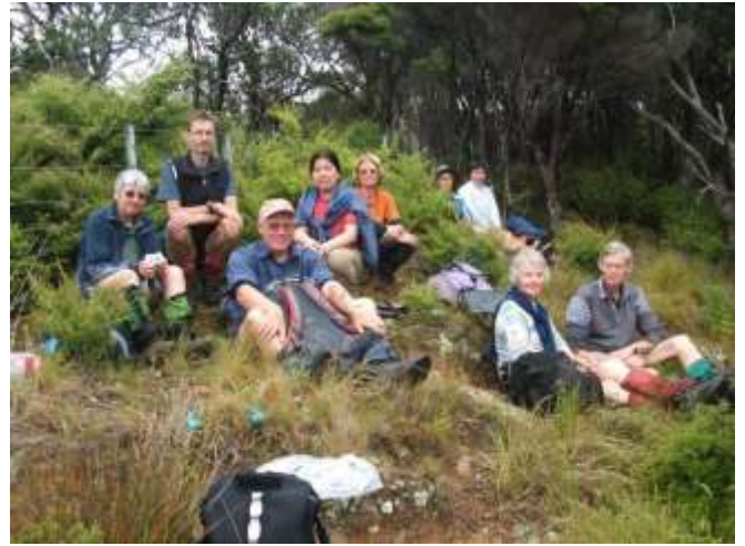
West Auckland Tramping Club-December 07

It is so heartening to have so many positive people with us!