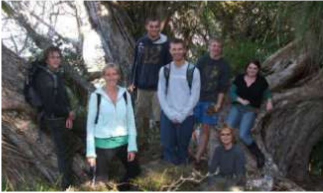
Global Volunteers January 08

Two groups of Global Volunteers Network students have been and gone and what a great bunch they were. Moehau Environment Group had the first group helping with the rodent monitoring in the Wetlands Project at Waikawau Bay.