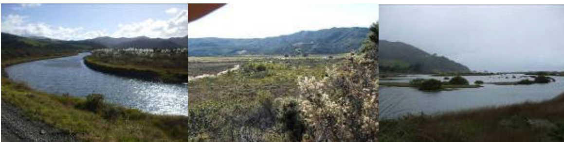
Waikawau stream, North Waikawau Bay. Wetlands from the Benton track

This wetland project is part of greater system of restoration being undertaken by Moehau Environment Group in the Northern Coromandel. Other MEG projects include: a buffer zone for pest control of approximately 2km wide, in operation from the east to the west coast, just north of the wetlands and estuary; a rodent control project, which has recently allowed the reintroduction of North Island robins into the Pt Charles area; mustelid control over an area of 10,000ha (the MEG Kiwi Zone); and considerable environmental education, such as the annual MEG Summer Holiday Programme. All projects have a public buy in, which has leant greatly to their success.