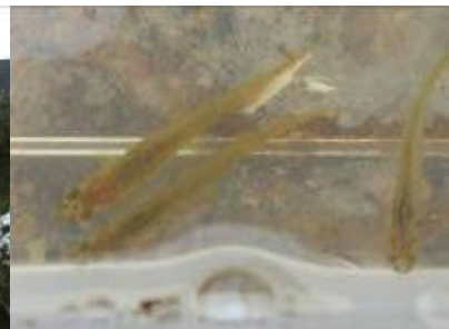
Inanga netted in Whitehouse ditches.